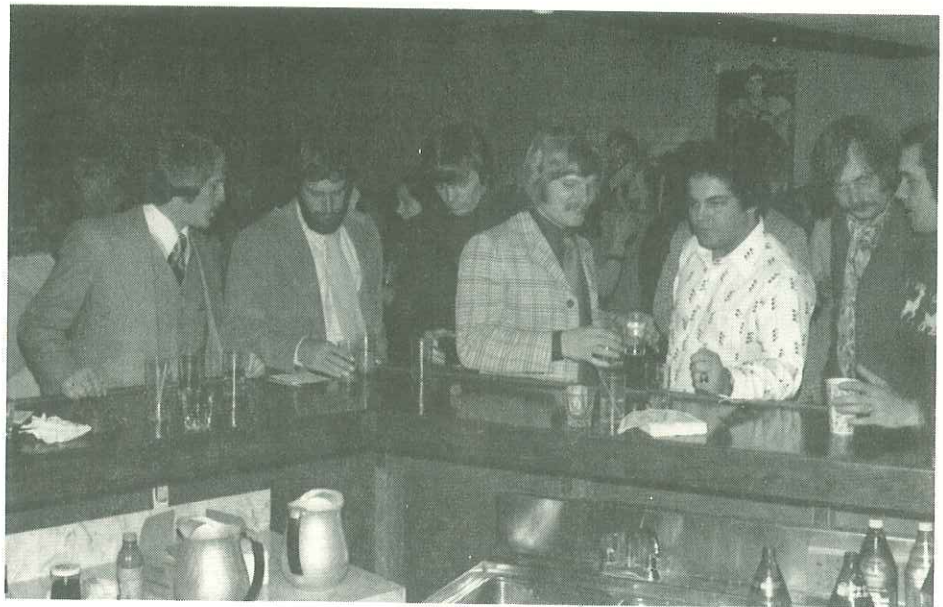
THE BOYS — BACK IN TOWN. This year's Alumni Weekend is October 15th.

Parent's weekend was a big success with 180 attending a formal cocktail party. London Broil dinner and casino night. Immediately following came GM week (Party Week) which revealed new two activities: The "Mr. RPI Pageant" and the "Gong Show", both of which were a success. Two chariot teams