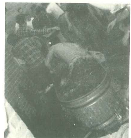
LOKAR SAID IT COULDN'T BE DONE. Swimming lesson have officially replaced the flag pole.