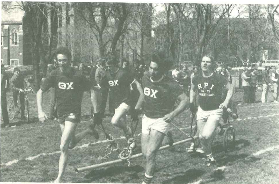
LAST YEAR'S CHAMPIONSHIP CHARIOT TEAM. This year Theta Chi could do no better than a second.