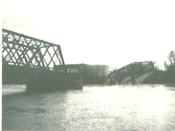
COLLAPSED GREEN ISLAND BRIDGE. Luckily an early Pledge week saved this year's Bird Walk.