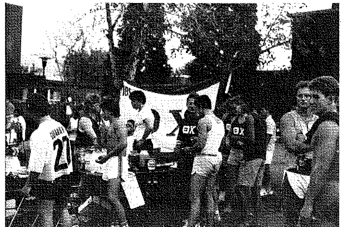
A Saturday cookout in freshman dorms.