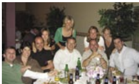
The second Alumni Weekend successfully brings old and new friends together again.

Next year is the Centennial of Delta Chapter, and the celebration of this event has been planned to coincide with the last RPI home game ever to be played on the '86 Field. Everyone—please mark your calendars now for this very special, once-in-a-lifetime weekend on November 7 th and 8 th , 2008! See you then!!