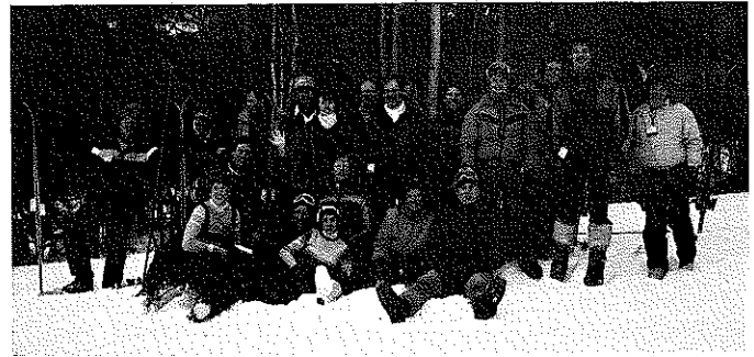
Alumni ski weekend at Mount Ascutney, February 25-28.