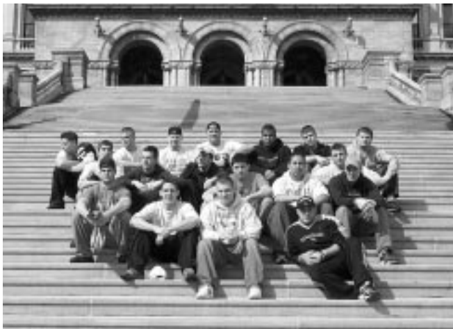
The current junior class at the house will carry forward the traditions of Delta Chapter.

ternity has adopted an alcohol-free policy for all of its chapter houses. But the National also approved and implemented a waiver program for eligible chapters. This waiver