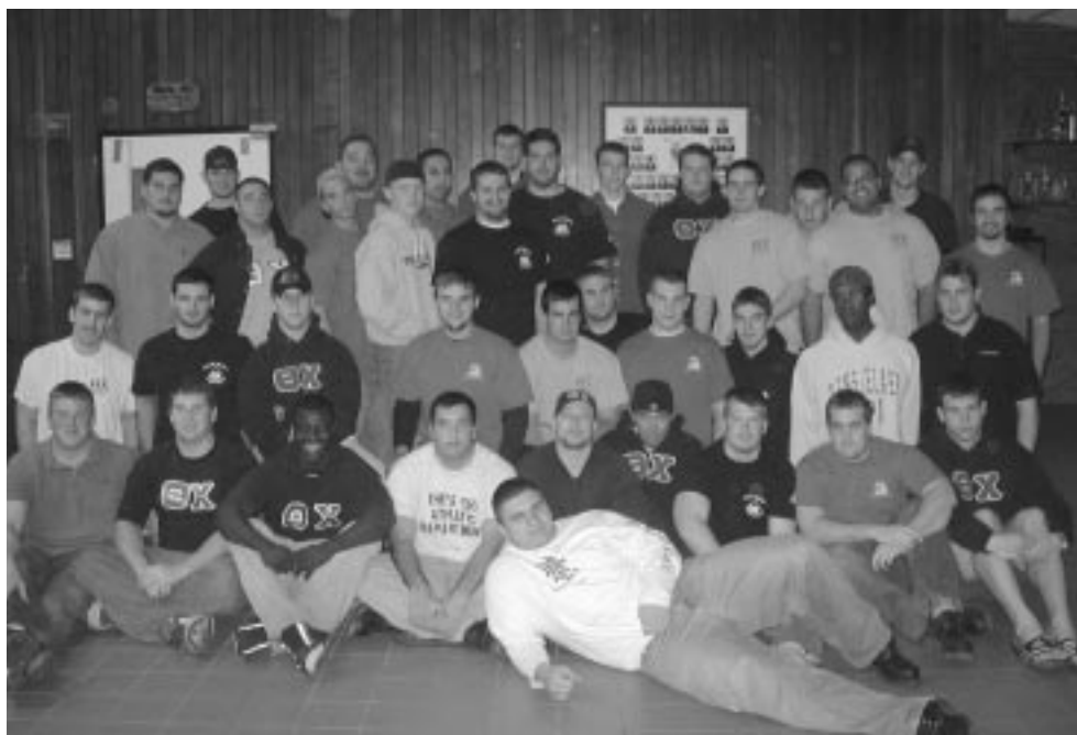
2002-'03 Delta Chapter brothers.